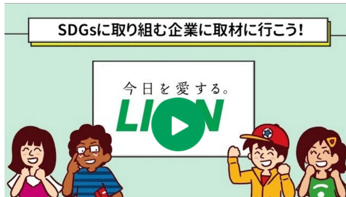
Video about Lion's SDG-Related Initiatives [Japanese] Initiatives to reduce plastics and the importance of hand washing habits