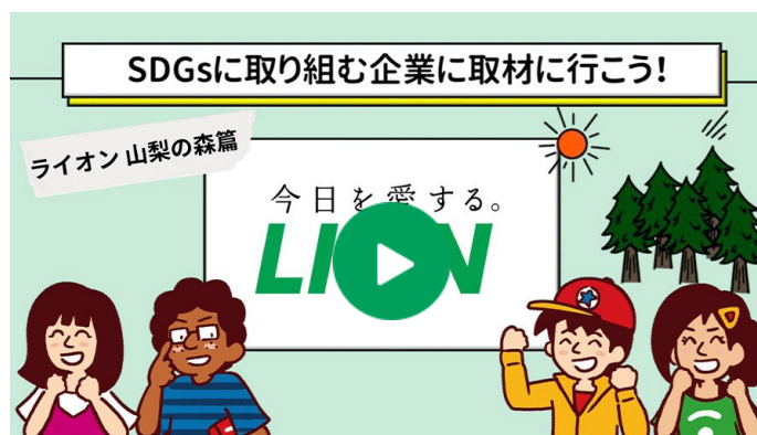
Video about Lion's SDG-Related Initiatives [Japanese] Lion Forest in Yamanashi

The channel also offers a series of videos highlighting companies implementing SDG-related initiatives. These videos are aimed at helping children understand the SDGs as something familiar and relevant to their lives and help them think about their own futures by showing actual initiatives being undertaken by companies to solve social issues. Lion's initiatives regarding SDGs are featured as follows.