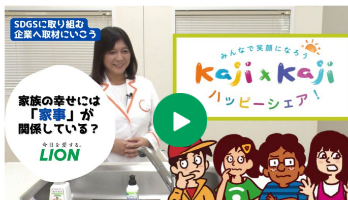
Video about Lion's SDG-Related Initiatives [Japanese] Efforts to Achieve Gender Equality through Housework Sharing