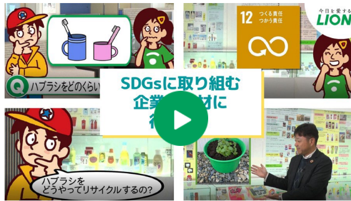
Video about Lion's SDG-Related Initiatives [Japanese] Initiatives to create a healthy future from oral health